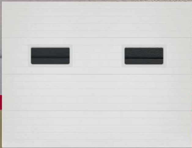
9' x 7' 3236 white with optional 24" x 12" windows and tinted glass