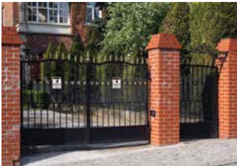
Entrances with Electronic Locks Requires Universal Receiver