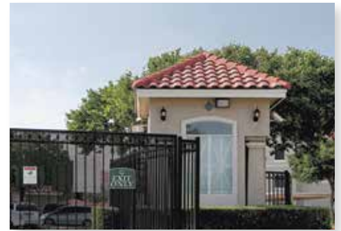
Backup Access at Gate House