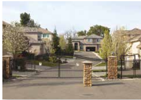
Small, Gated Cul-de-Sacs