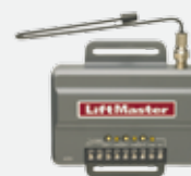
Universal Receiver (850LM/860LM)

64 in. in-ground mount pedestal, 2 x 2 in. square pipe with a black powder-coated finish, 11-gauge steel.